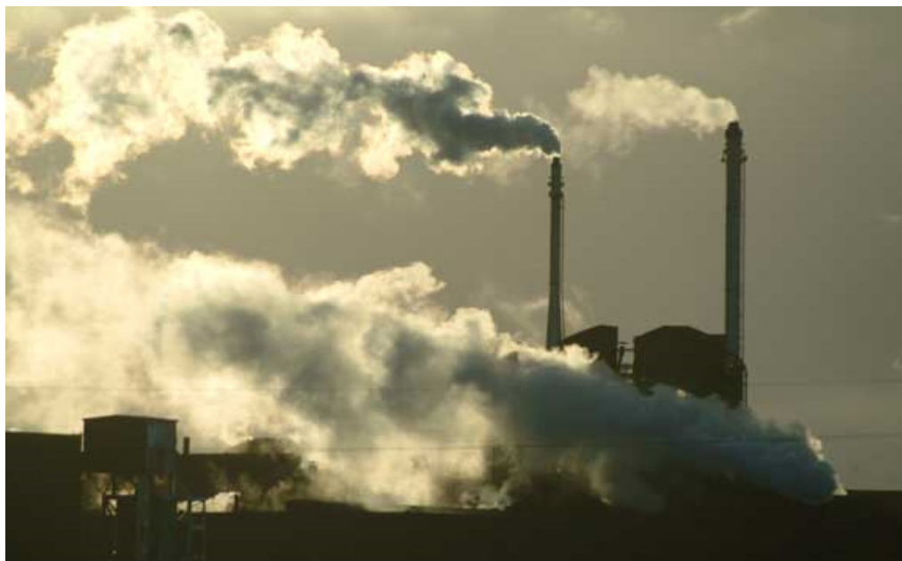
The other side of Prosperity: Carbon Dioxide from our factories rises into the air, warming the Earth's atmosphere and contributing to an environmental crisis