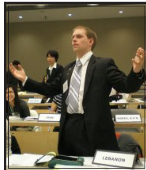
Friends, Delegates, Citizens: Lend me your ears!