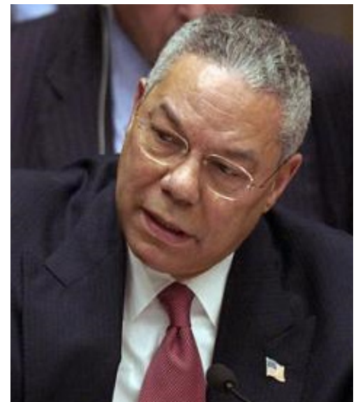
When the P5 speak, all listen: Colin Powell in February 2003