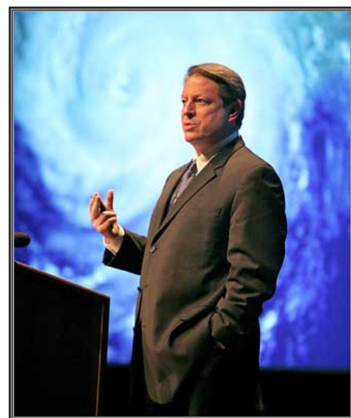
Yes, Mr Gore, it's a problem- but tell us how we can balance economy with environment?

Placing restrictions on industry before giving them any time does not make sense. There is a need to implement emission reductions; however, proper planning and the idea of correct timing must come into play. Industry must be given the chance to adapt and to invest, otherwise we will see dire economic consequences in addition to our already fragile environmental future.